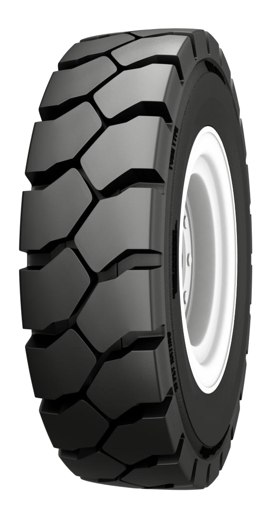
Note: These are the tires being released from India The following sizes are only available from China: -4.00-8, 23X9-10(225/75-10), 7.50-16, 32X12.1-15